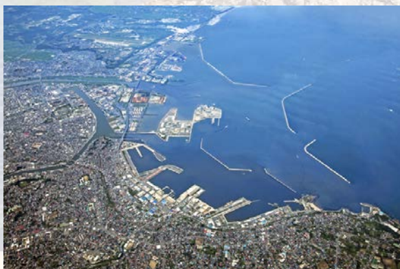
Fig. 4 Aerial view of Hachinohe city