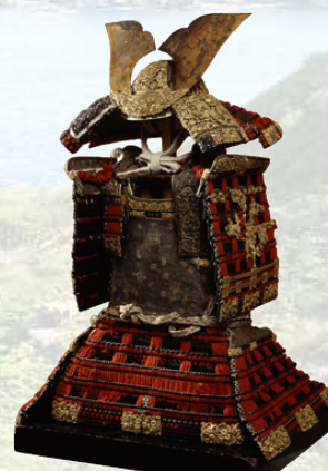
(b) National treasure