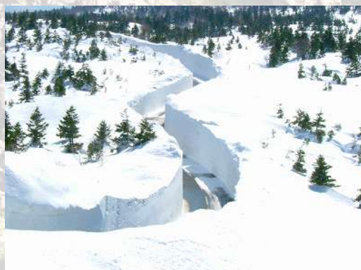
Fig. 5 Hakkoda Snow Corridor